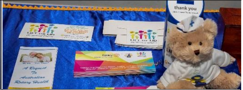
Some of the Australian Rotary Health promotional material. Available to members.