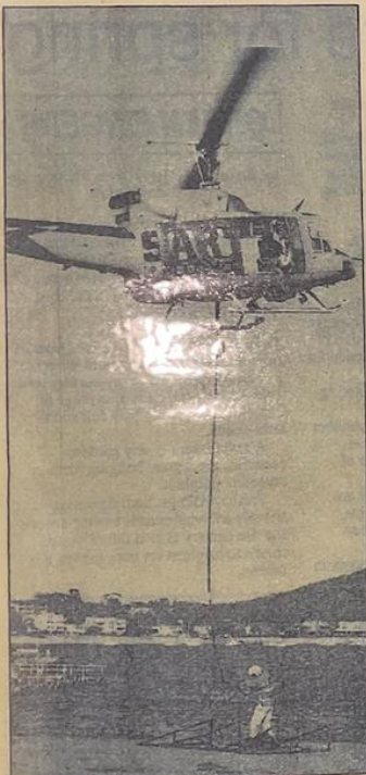
■ A search and rescue helicopter lifts off with the WW2 radar dish last year

The RAAF is waiting for approval from the National Parks and Wildlife Service to re-erect the WW2 radar scanner it removed from the top of Tomaree Head about two years ago.