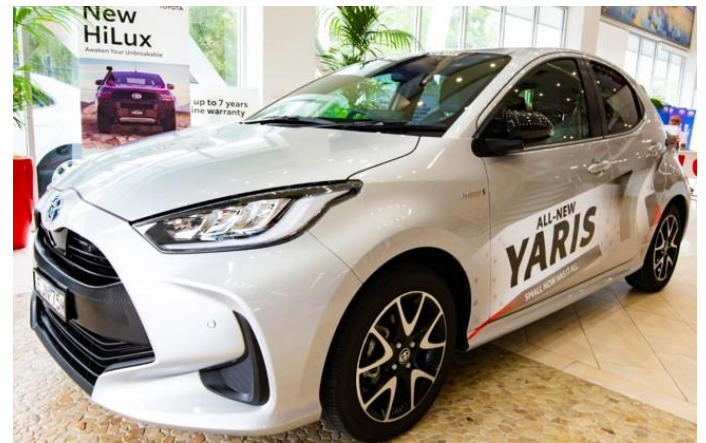
A Yaris will be offered as a hole-in-one prize at the Rotary Charity Golf day