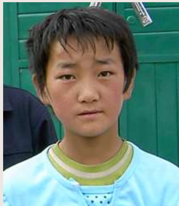
2008 Elementary School Award Recipients