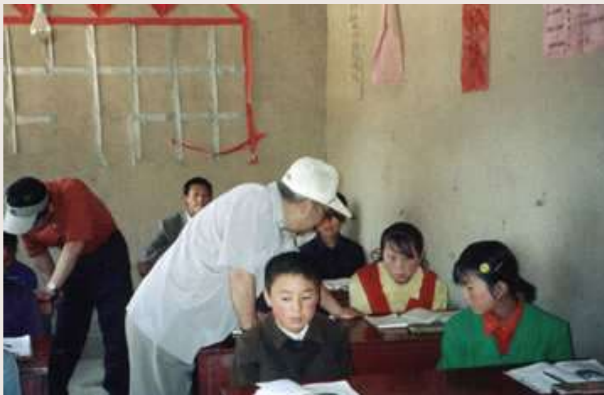
Our First Visit in 1999