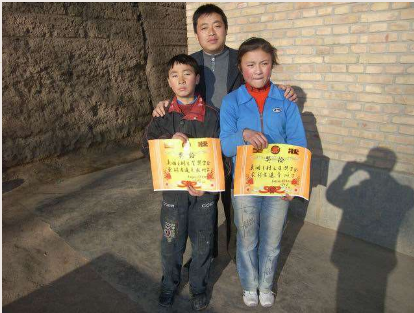
2006 Elementary School Award Recipients