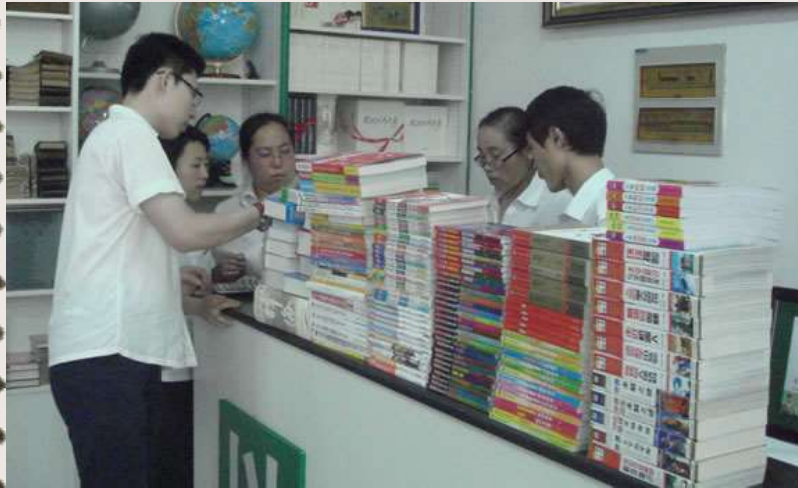
Employees of a bookstore in Beijing selecting and counting the books