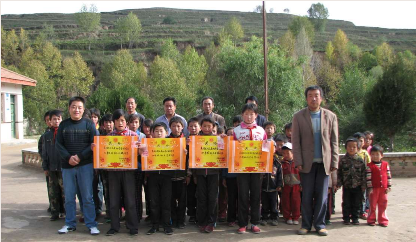
小安岔 Elementary School