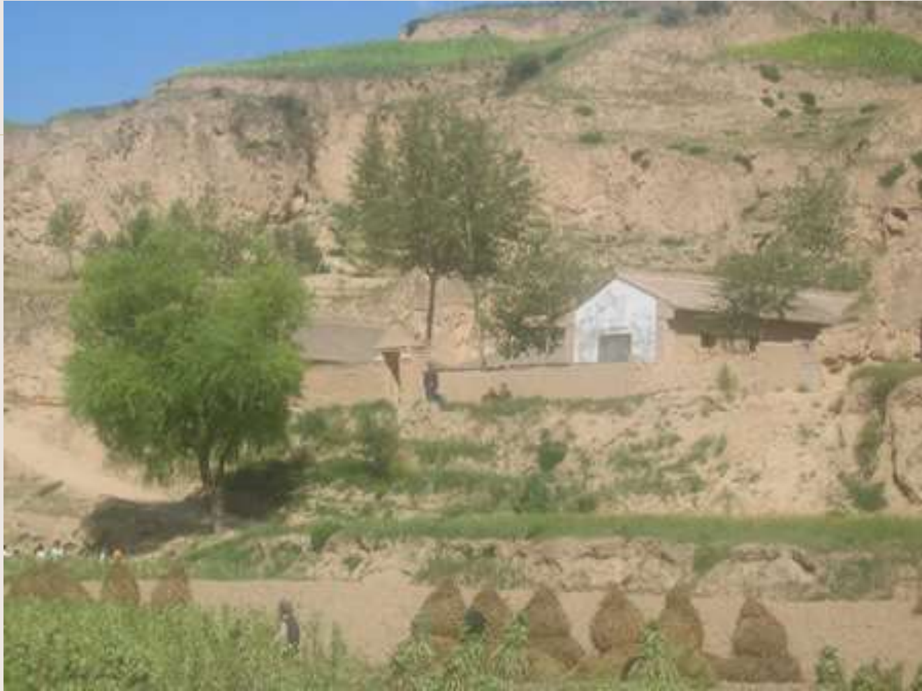
XiaoAnCha Elementary School