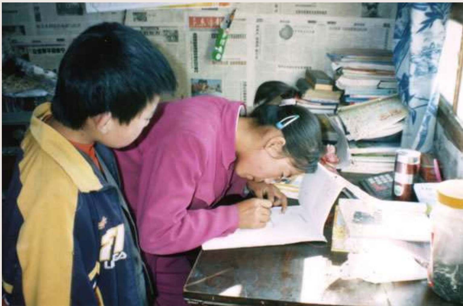
Award Receivers Signing Names (Shiao-An-Cha Elementary School, 2005)