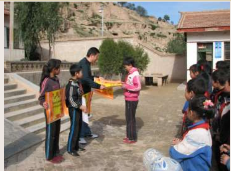
小安岔 Elementary School