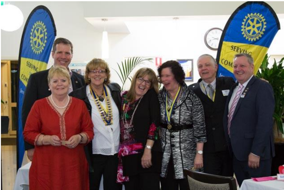
The new President and her Secretary

Hello to the New Board! As of 1 st July – Welcome on-board to the new Board!