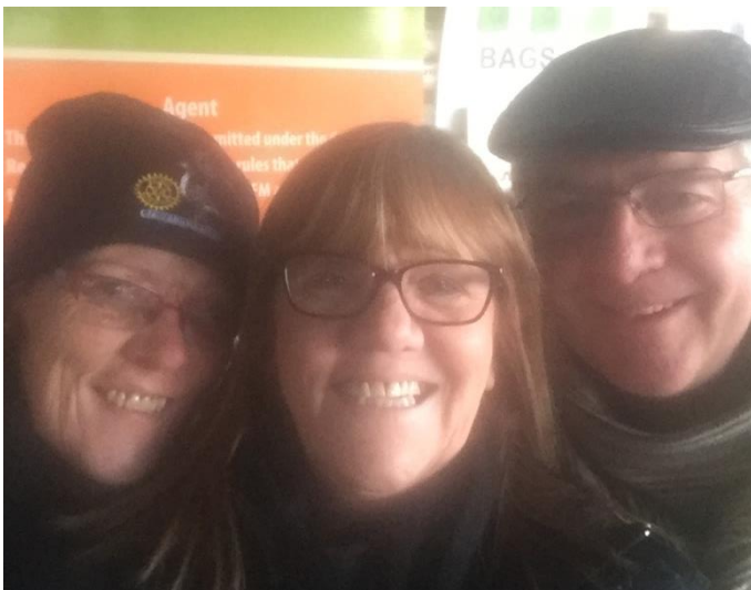
Dream Team 1 – must have been foggy!!

Market Roster is current as of the date of publishing however changes may have occurred. Please visit: http://portal.clubrunner.ca/9728/SitePage/capital-region-farmers-market/roster for the most up to date roster.