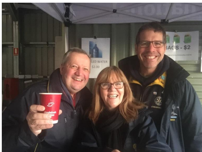
Dream Team 2 – having coffee to warm up!