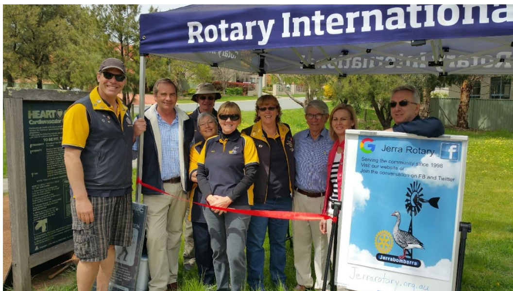
The 'A' Team