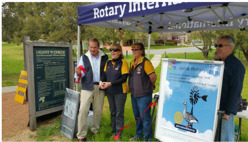
The cutting of the ribbon for the 1 st station refurbishment