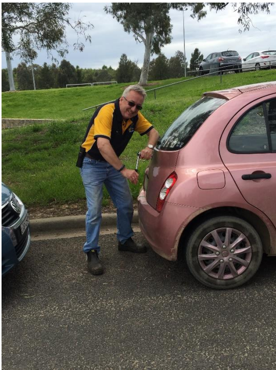
Mez's Pink Car

Please feel free to send me any captions you have for the photos below. There will be a prize for the top caption for each of the photos.