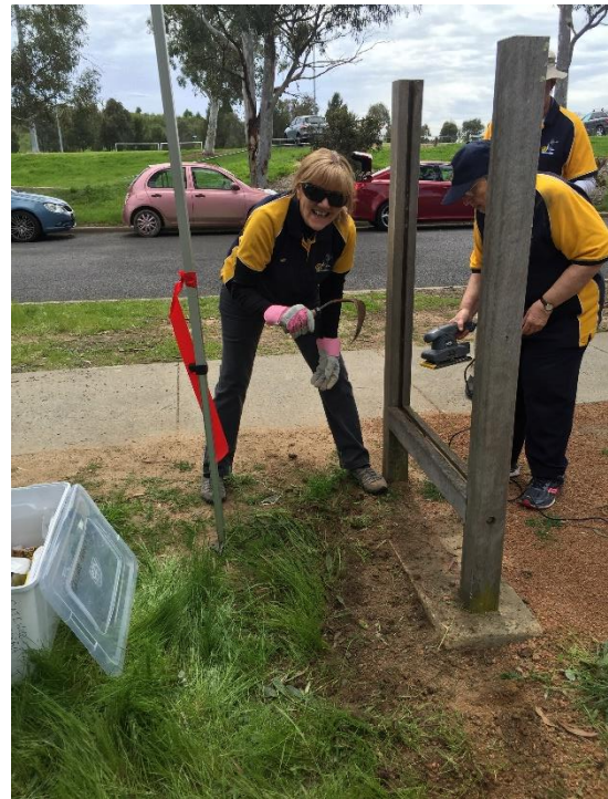
Mez's Pink Glove