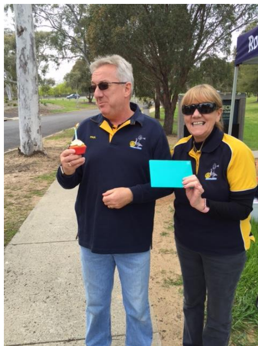
Happy Birthday to me...