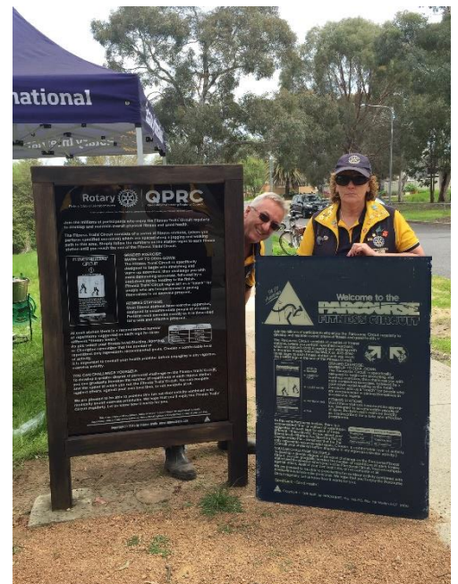
Before and After (and photo bomber)