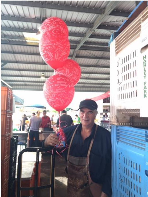
Birthday Boy at the Markets!

Reminder on times – Arrive 6.45 am / Set up by 7 am / Parking by 7.30 am / Finish Parking at 11 am / pack up at 11.30 am