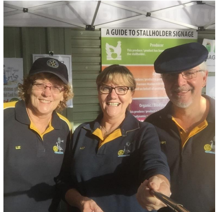
Dream Team reporting for duty!