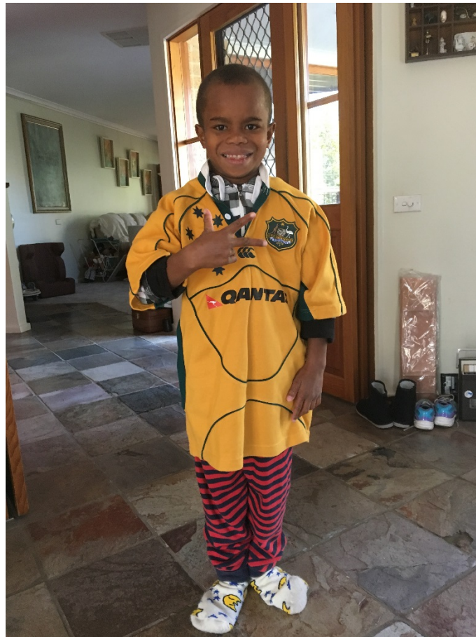
Watch this space, returning soon! Can't wait to see his cheeky smile!

Reminder on times – Arrive 6.45 am / Set up by 7 am / Parking by 7.30 am / Finish Parking at 11 am / pack up at 11.30 am