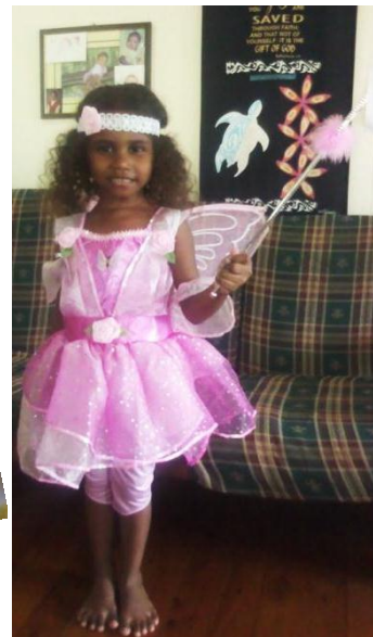
Fitz and his loving sister home together! He's happy!