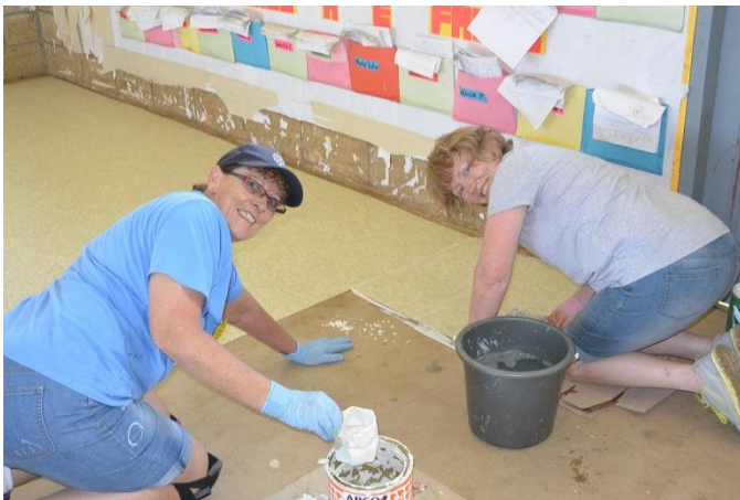
Not your best view, ladies!