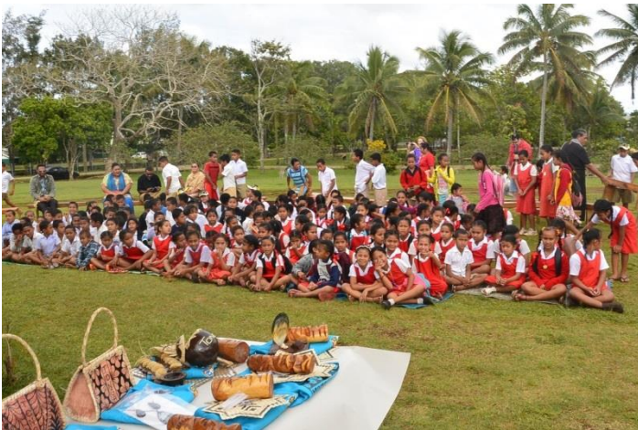
CONGRATULATIONS AND WELL DONE, EVERYONE!