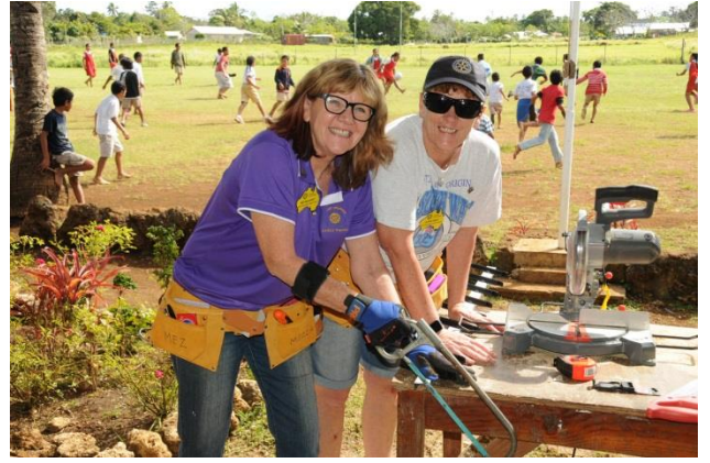
The girls hard at work...or pretending to be!