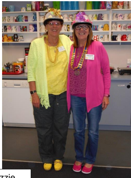
Pres. Mez Pink & Tweetie Bird Yellow Lizzie Note matching shoes!! Almost twins!