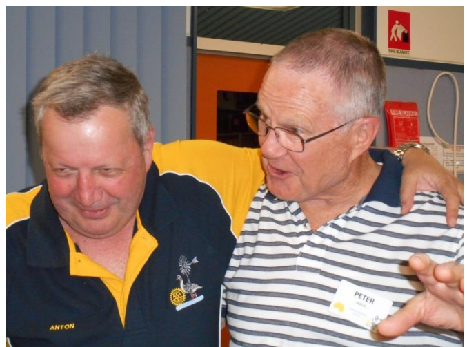
The Eidelweiss Boys' Choir sing their farewell song! AGAIN!