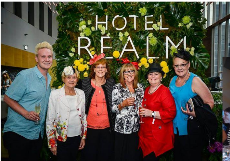
Some people had time for Melbourne Cup celebrations!