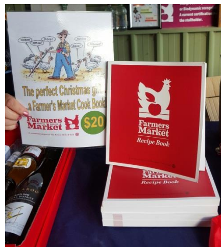
Cookbooks NEW sign! →