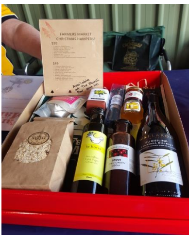
← Hamper Packs for sale.

Market Roster is current as of the date of publishing however changes may have occurred. Please visit: http://portal.clubrunner.ca/9728/SitePage/capital-region-farmers-market/roster for the most up to date roster.