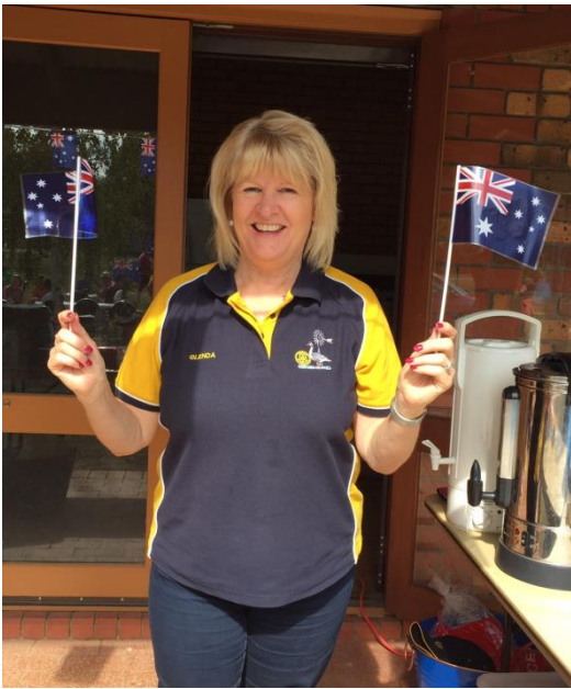
Glenda waves the flag!

Hannah also sent a message to wish every one a Happy Australia Day.