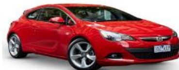
Holden Astra - Hole in One Prize