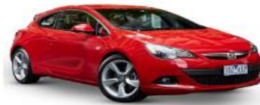
Holden Astra - Hole in One Prize