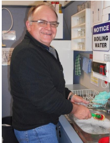
And he smiles while he washes up!