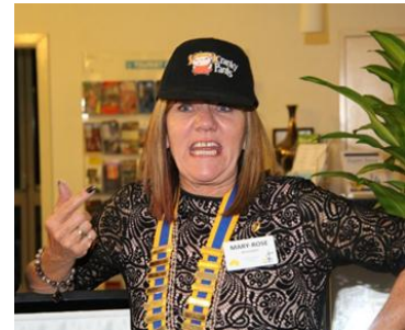
Hang in there, M-R! Only 47 weeks to go!