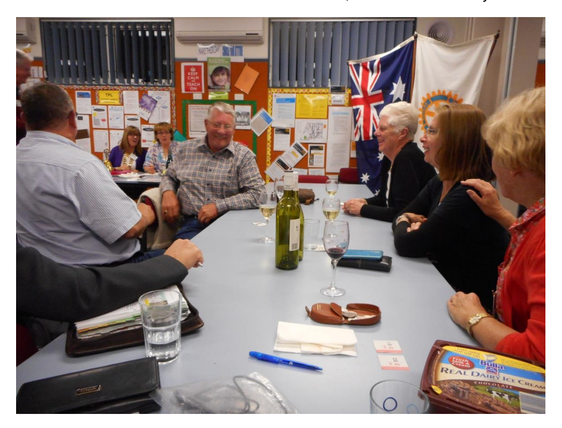
Quality Rotary time with friends!