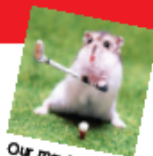
Our mouse-scot - Rory Mackelmouse