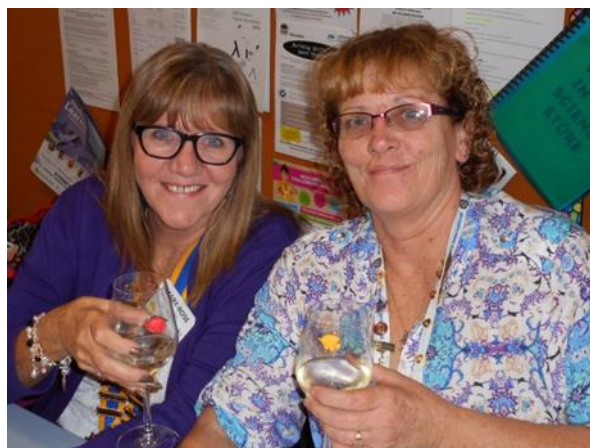
They are IN Scotland! Enjoy the rellies!

(P.S.: They're still gone!! We are partying! But so are they!)