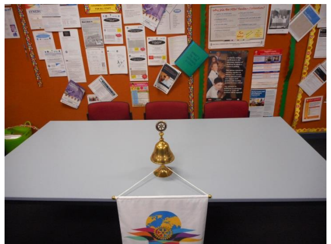
The top table is a very lonely place!