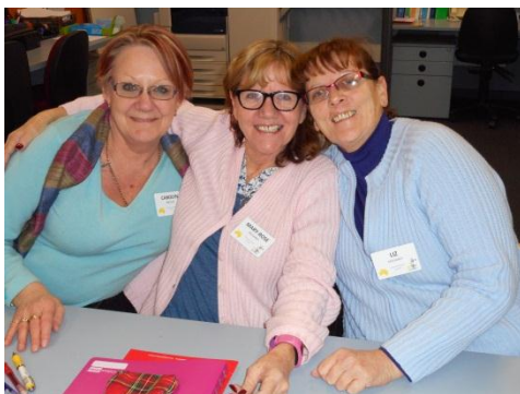
The pastel Wiggles on the top table!