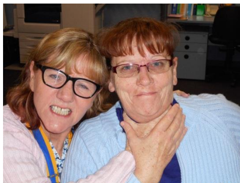
Sisterly love – maybe not!