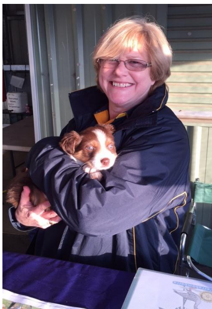
His & Hers matching puppy photos!