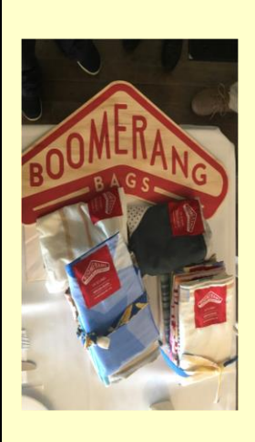
Boomerang Bags merchandise ©