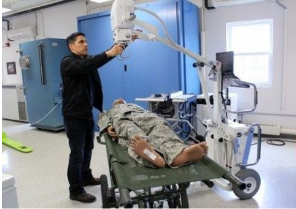
X-Ray unit with RIS