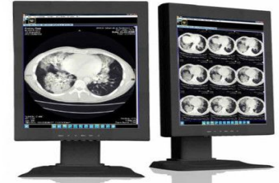
PACS Port Villa