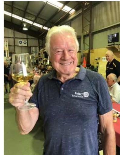
Being Chairman of the Wheelchair Trust is an awful lot of hard work, but it has its compensations, including raising a toast to the workers at our Christmas party! Ed.

A special mention must go to a local donor who wishes to remain anonymous, who made a substantial, much appreciated 5-figure donation to our Wheelchair Trust. Thank you!