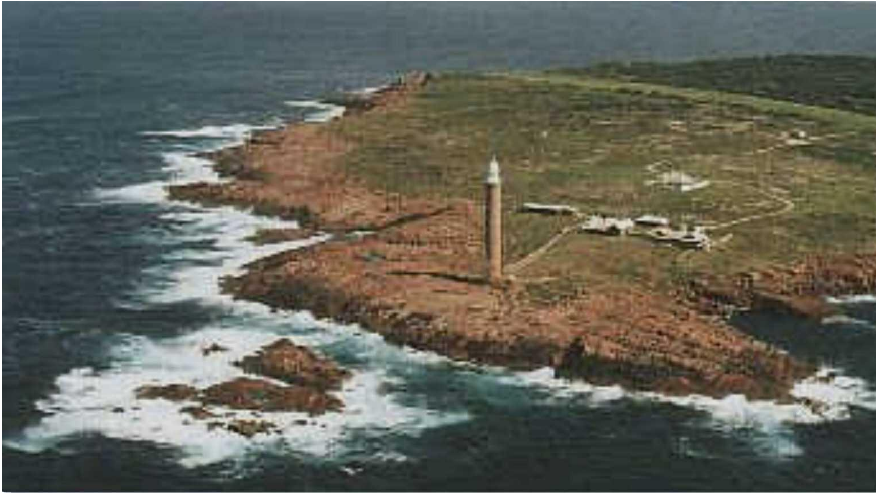
Gabo Island: 1955 - 1962