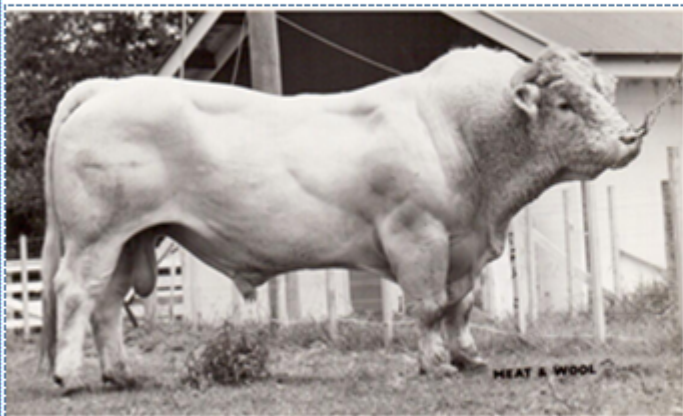
'Grogan Centurion', the first pure bred Charolais bull to be imported into NZ from England.