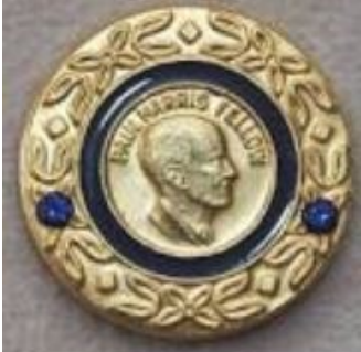
Paul Harris Fellowship pin with 2 sapphires (in total awarded 3 times)

As Rotarians, we are all part of a global network that bridges barriers to create a better world. The Rotary Foundation impacts places that need us most because of our service and support, but help is needed more than ever, and we cannot do it without you.