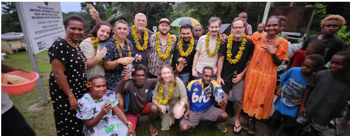
Once the building was all up, the first Vanuatu construction crew celebrated with the locals

(Also, check the Mauna website www.maunahealthcentre.com as well as the Download files on www.rotarysurferssunrise.org for a slideshow and press release.