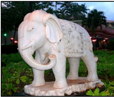
Photo Above: The “White Elephant” photo was taken by Rotarian Jack Wallace during a trip to Hawaii in 2008.