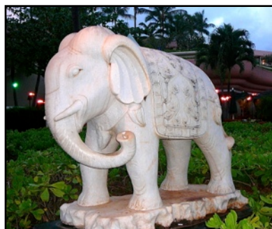
Photo Above: The "White Elephant" photo was taken by Rotarian Jack Wallace during a trip to Hawaii in 2008.