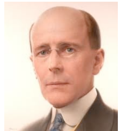
Photo: Paul Harris, Rotary Founder.

TRF now supports hundreds of meaningful projects including Polio Plus, the Rotary project to eradicate Polio.