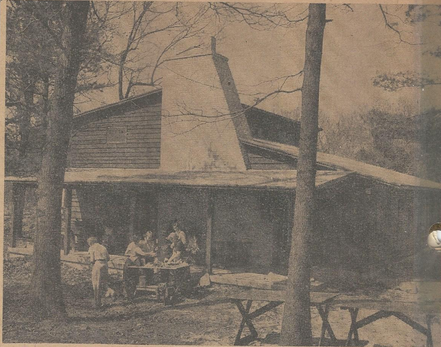
New Winchester Girl Scout cabin in Middlesex Fells. Valued at $25,000, ultramodern camp was built by Rotarians and fathers of Scouts.

by the Girl Scouts. They continued to do housecleaning tasks, to sell seashells, to baby sit, to pick blueberries, accept any job that promised to net a penny or dollar profit. En Ka, a Winchester women's club, held fairs and individual benefactors, many unable to