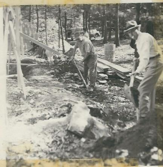
Bill Richardson