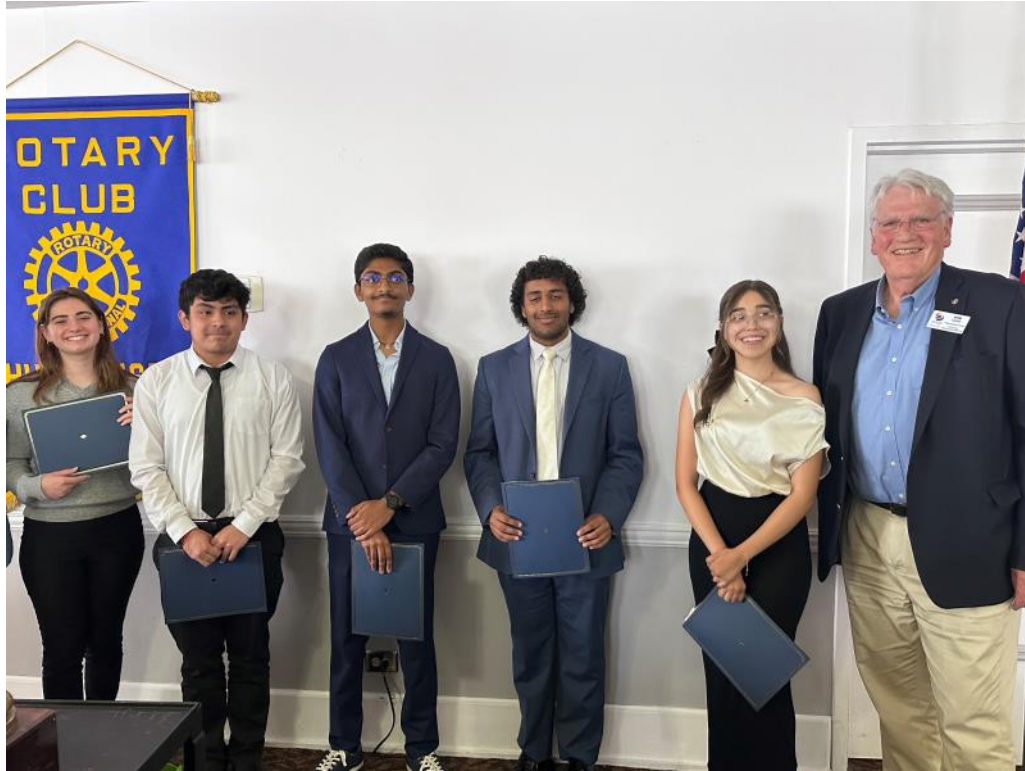
The five students who spoke to our Club were from all over the County and one student was from Calipatria, in the Imperial County.