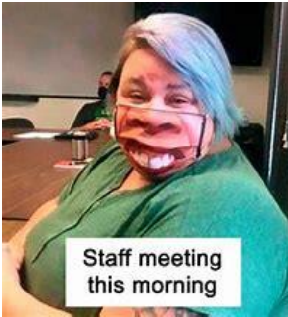
Staff meeting this morning