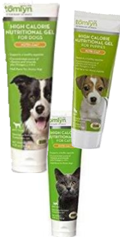
Nutri-Cal for puppies, dogs and cats