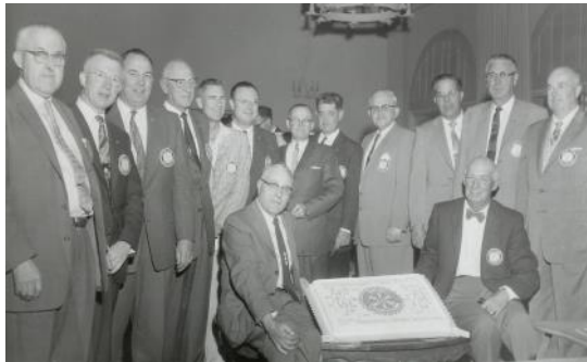
1959 – Past Presidents