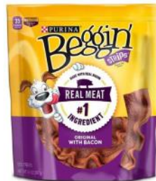
Beggin' Strips dog treats