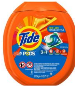
Laundry detergent - liquid or pods