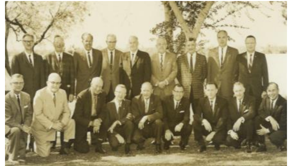
1963 – Past Presidents