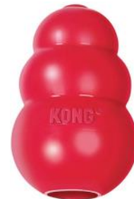
Extra large Kongs for dogs