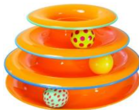
Cat toys and charmer and tower of tracks