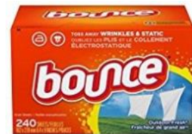
Fabric softener sheets