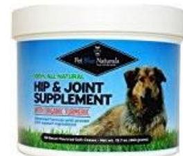
Hip and Joint Supplement for dogs (Glucosamine Chondroitin)