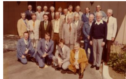
1978 – Past Presidents