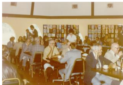
1982 – Typical Weekly Meeting