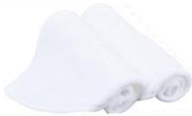
Hand towels and wash cloths in good condition