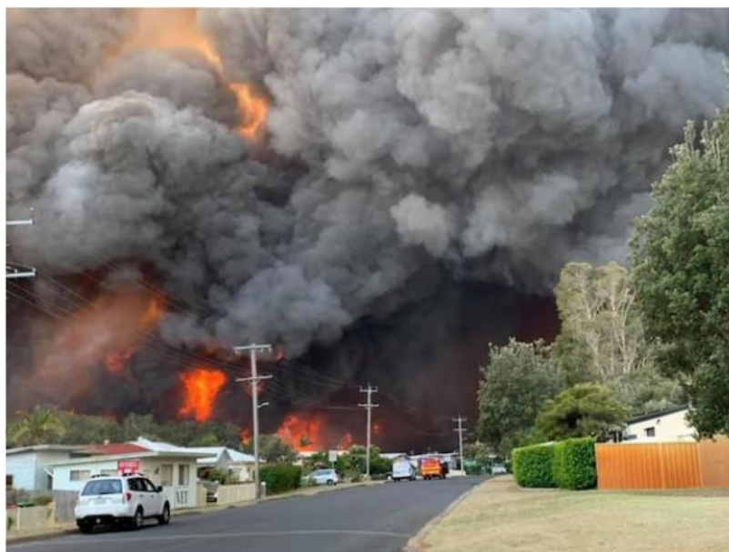
NSW Bushfires.

ROTARY AUSTRALIA WORLD COMMUNITY SERVICE