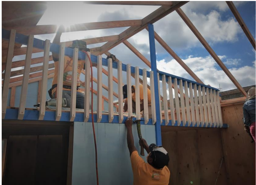
Above and below left: The crew safely securing the loft area. Below right: Mother Gabriela pitching in to secure the windows.