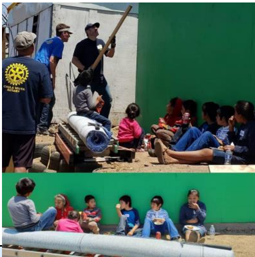
Tijuana Home Building—Thanks again to all the volunteers from both Eastlake and Chula Vista clubs. Thank you to Ben Koala for these pictures he posted on the club’s Facebook page. Another heart-warming project that helps those in need in our neighboring country.