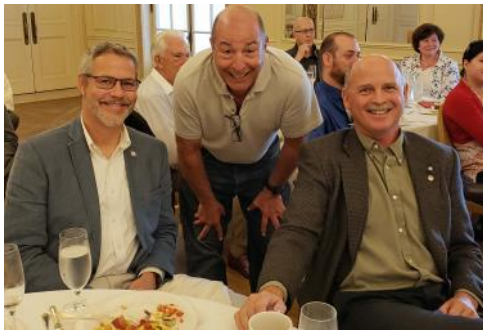
The three comedians