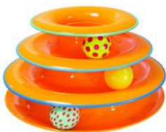
Cat toys wand charmer and tower of tracks