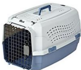
New or gently-used animal crates, small & medium size