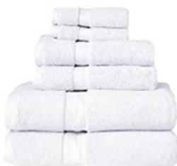
Bath towels, hand towels, wash cloths in good condition