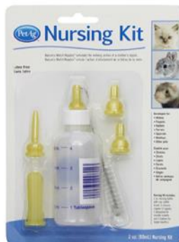
Nursing bottles for kittens, puppies, bunnies & other small animals