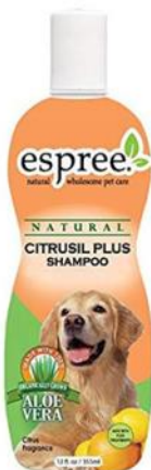
Espree Citrusil Plus Shampoo