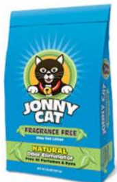
Unscented clay litter