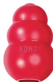
Extra large Kongs for dogs