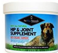
Hip and Joint Supplement for dogs (Glucosamine Chondroitin)