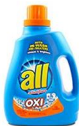
Liquid laundry detergent