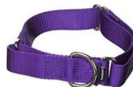
PetSafe Martingale dog collars (medium)