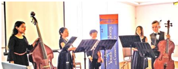
CVESD Students— The Opus Project