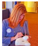
A new Petunia is with us for the next quarter. Please donate to eradicate polio.