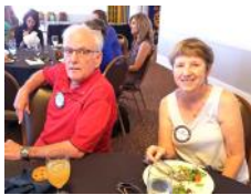
The Dinsmores are off to Michigan to be with Grandchildren

Installation/Outstallation— June 10— Westgate Brunch— Tickets $65 each— Pay on line or check to Diane