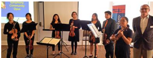
The Conservatory Choir