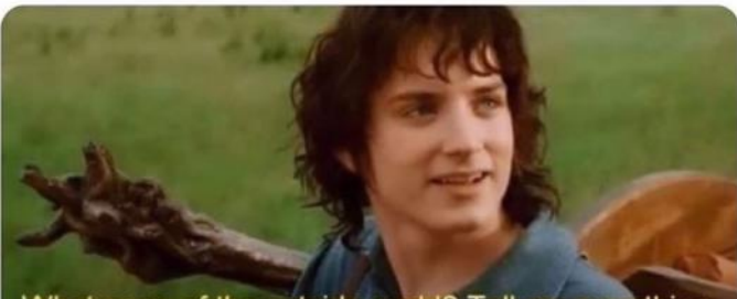
What news of the outside world? Tell me everything.

When someone in the house returns from the grocery shop