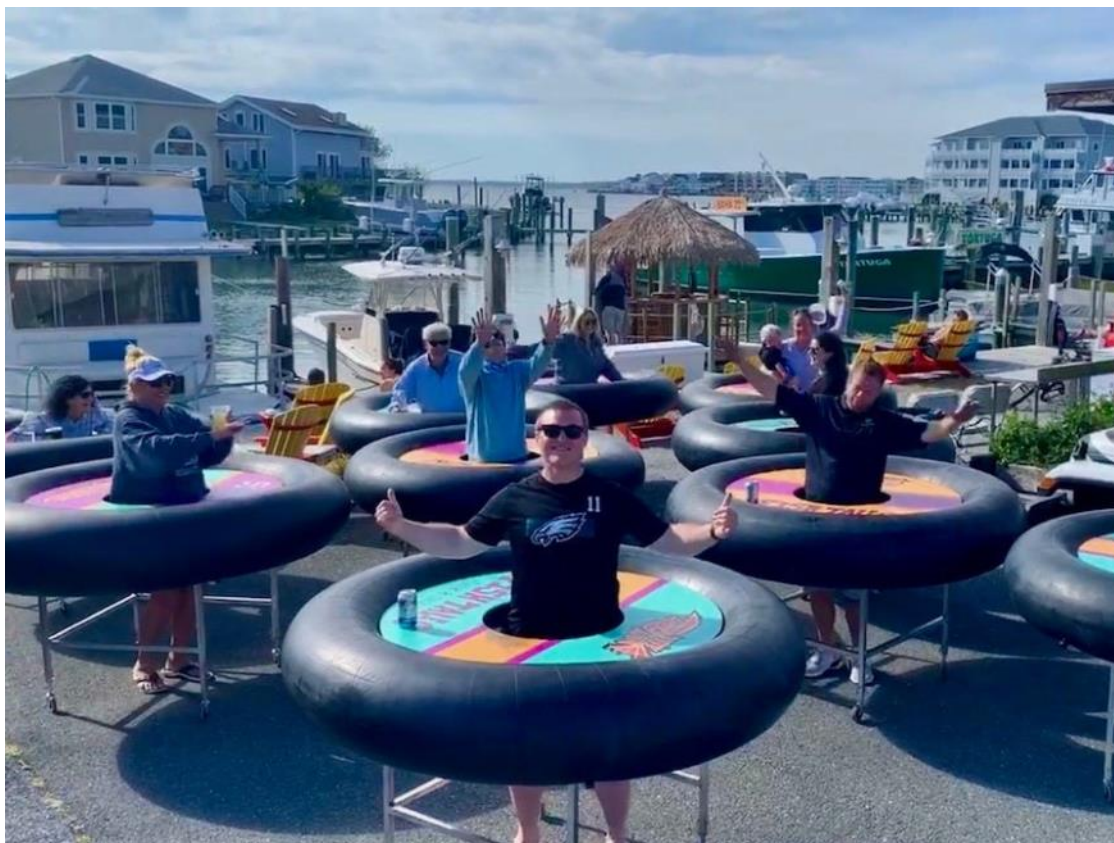
New tables to assist in social distancing...

Attitude is the little thing that makes a big difference