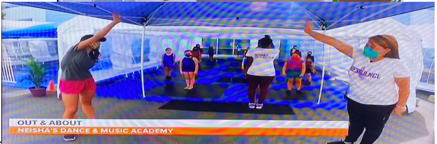
OUT & ABOUT NEISHA'S DANCE & MUSIC ACADEMY