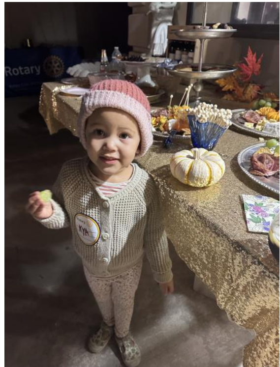
Sweet Kya Koala enjoying grapes at the Three Rotary Club event.

This presentation is made possible by the FBI San Diego Elder Justice Task Force in partnership with the FBI San Diego Citizens Academy Alumni Association, AARP California, and the San Diego Seniors Community Foundation's Senior Center Coalition.