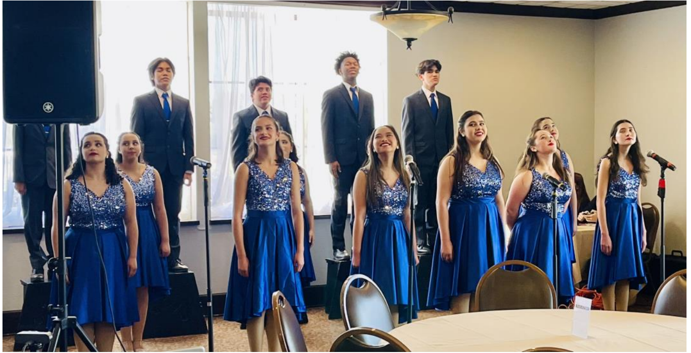
The Bonita Vista High School Music Machine continues its tradition as one of the best high school performing groups around!