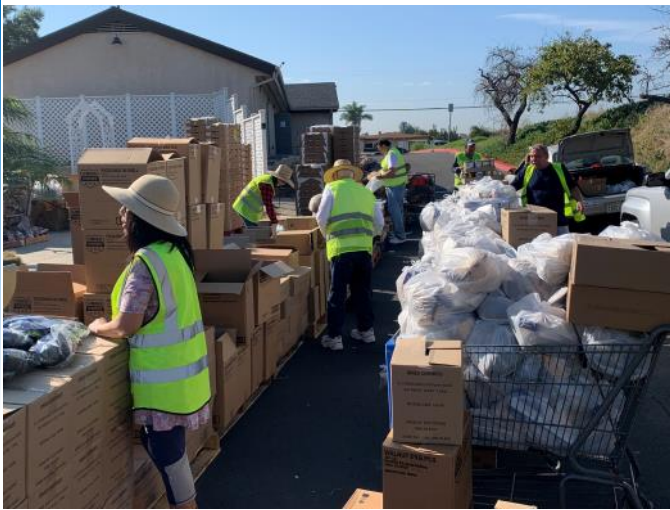
L-R: The scene at St. Mark's for the food distribution last Friday.