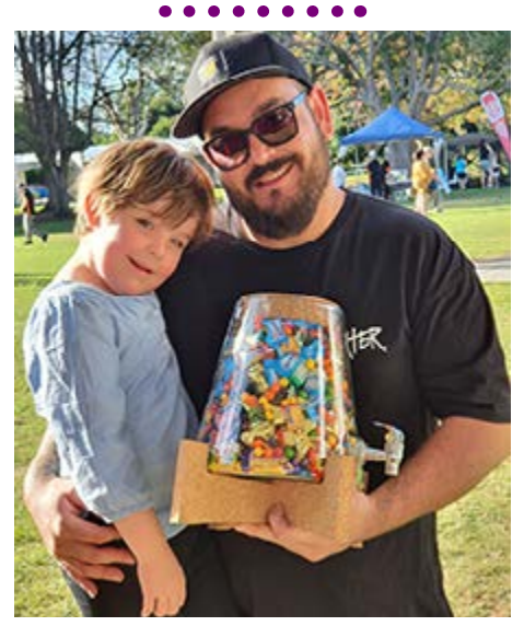
This little girl was the proud winner of the Lolly Jar Guessing Competition at the Lake Macquarie Autumn Fair.