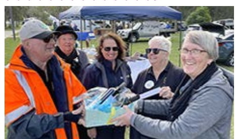
A great day out at the recent Warners Bay Markets.