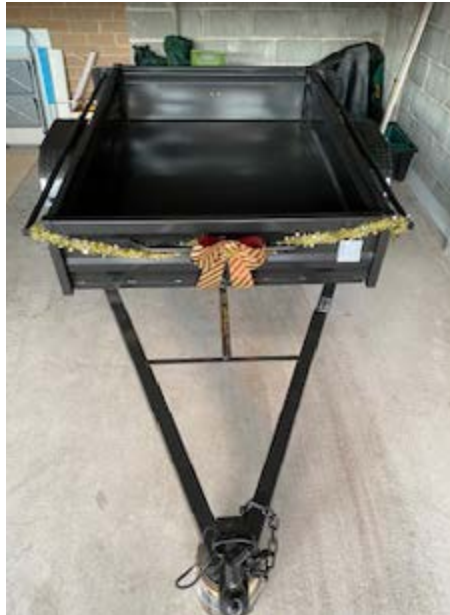
Christmas Trailer October 2020

I will keep you all informed on progress as it happens. We look forward to a successful outcome of the project for both “ Survivors R Us ” and the Club.