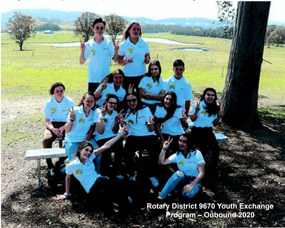
Rotary District 9670 Youth Exchange Program – Outbound 2020

The Rotary District 9670 Youth Exchange Program Committee, along with the Inbound and Outbound students, sends our Rotary Club their thanks for sponsoring & hosting a student, during this difficult year – and appreciates our understanding, assistance & friendship.