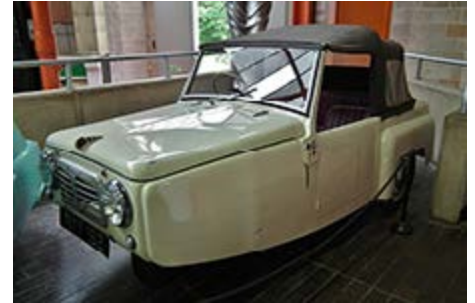
1953 Robin Reliant Regal Mk I

https://en.wikipedia.org/wiki/Reliant_Regal